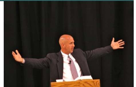
How He Loved to Preach Christ!