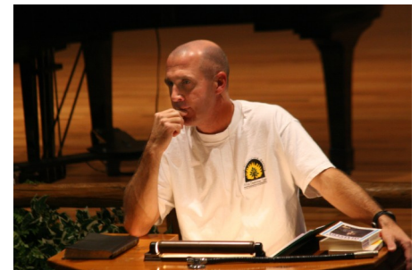
Teaching Spurgeon Conference