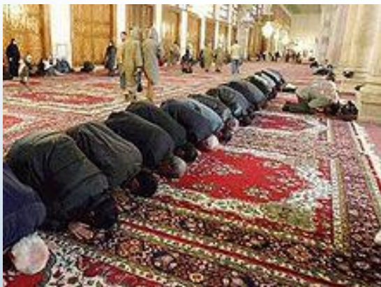
Muslim Prayer (salah)