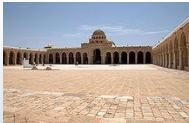
The Great Mosque 670 Tunisia