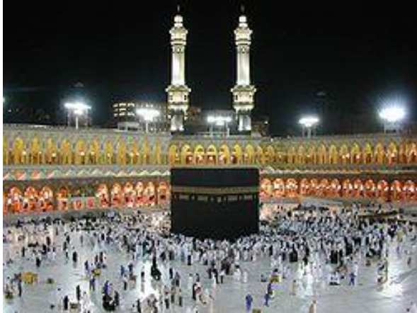
The Kaaba, Mecca